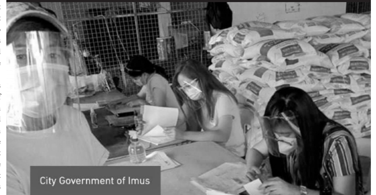
City Government of Imus